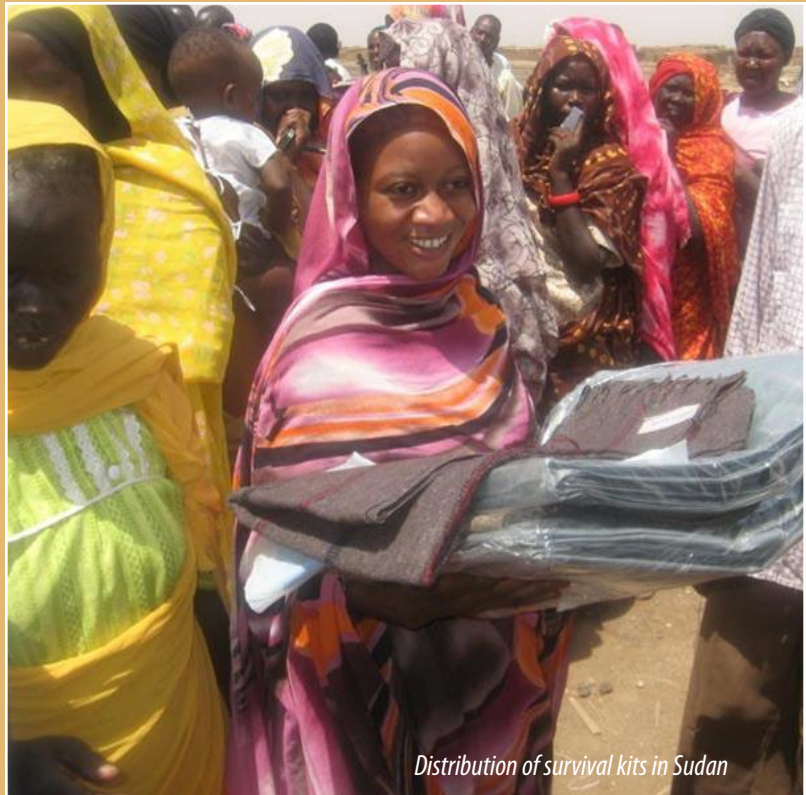
Distribution of survival kits in Sudan