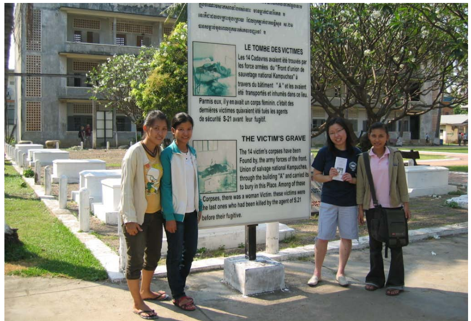
Tuol Sleng Genocide Museum, Phnom Penh, the site of a former high school what was used as the notorious Security Prison 21 by the Khmer Rouge.

As an alternative, my friend suggested Cambodia as a target country. At first, I was not interested, but after learning of the plight of the Cambodian people and the overwhelming darkness there, I was moved. Unfortunately, the summer program was full so I inquired about participating the next following year. I waited a long time, but I learned that it also tested my seriousness. Finally, I went to Cambodia in February 2008. The trip proved challenging since most of the students we wanted to minister to were not at Phnom Penh due to Chinese New Year.