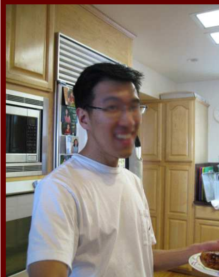
WCC 2010 Workshops "Commissioner"

As a child, Christianity was about Sunday school, not swearing, and "being a good kid". As an adult after college, I questioned the culture that I grew up in. If Christianity was simply ascribing to a cultural standard, then I wanted to let it go. I knew people who were more compassionate, humanitarian, and passionate than the Christians I knew. If I was a Christian, then how could I be so narrow-minded?