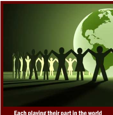
Each playing their part in the world