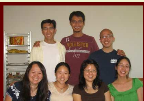
WCC 2010 Executive Committee Directors