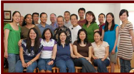
WCF leadership group photo

The meeting continued with morning updates to the board from the WCC Planning Committee and 25 th Anniversary Team regarding their planning progress for the next World Christian Conference to be held over President's Day weekend in February 2010 at Redwood Christian Park in the Santa Cruz mountains. Since WCC 2010 will have an anniversary celebration component, it was critical that the key leaders on the various teams began the process of collaborating together closely. Finally, the Executive Directorship Team, which serves as the interim Executive Director, joined the Board of Directors for their afternoon session while the Planning Committee split off into their own agenda for the weekend.