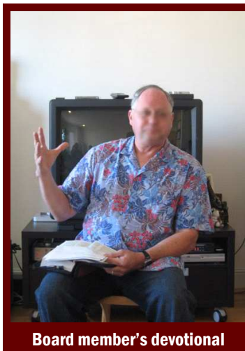
Board member's devotional

A privilege to serve ◇ The main sentiment felt throughout the gathering time was a tremendous sense of joy and gratitude that God would allow each servant leader to contribute to his Kingdom through their service to WCF. Furthermore, many felt that it was a privilege and blessing to be able to serve with others who share a like-mind and heart to see more Asian-American Christians mobilized for God's global purposes. Finally, in amazement the teams gave God praise for shepherding the World Christian movement and allowing WCF to play a part for the past 30-plus years as a prayer and mobilizing movement.