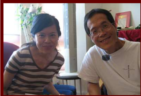
Present and past WCF Treasurer

Vision and purposes ▲ World Christian Fellowship (WCF) is committed to fiduciary standards that are above reproach and continuously strive to develop and improve the organization's financial and financial resource systems.