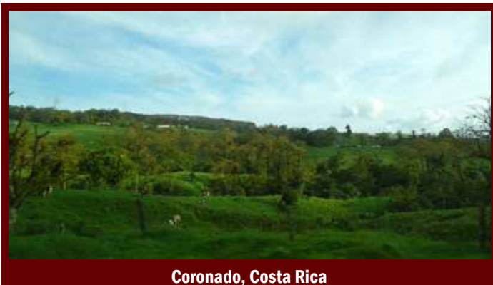
Coronado, Costa Rica

Flying in faith ✨ Our team and the host family went zip-lining through a forest canopy in Monteverde the day before we came home. It was incredibly amazing to count blessings while walking and zip-lining through the rainforest and drinking in the beauty of His creation. The longest and the scariest ride was called The Superman. One would do a superman pose with hands extended in front since there is nothing to hold onto. Our backs were, instead, attached securely (or we hoped) with three cables to the long horizontal cable. (The cables are several hundred feet high and thousands of feet long.) We could do nothing but to trust the creator of the zip-line and the strength of the cables. We felt God reminding us that this was like our faith — many times it is not until we let go of our control that He will take us on a ride of our lifetime! And sure enough, we could not stop praising Him as we rode through the valleys and marveled at the different shades of green on the hills!