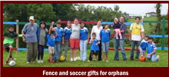
Fence and soccer gifts for orphans