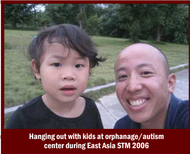
Hangin' out with kids at orphanage/autism center during East Asia STM 2006