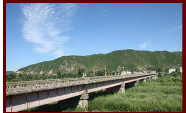
A literal bridge to restricted access country

The older I get, the more I realize how little I know! All I know (or so I think) is that I desire to know and worship Him more, and to serve as His hands and feet! Despite my impatient desire to go overseas and help with the urgent need in East Asia, the Lord has made it clear that He still has unfinished business for, and with, me here. In addition to serving with my local church, I currently have the privilege of serving as a BridgeAsia volunteer with OMF. This role allows me to raise awareness for an Asian geopolitical group under dictatorship rule that God has placed in my heart.