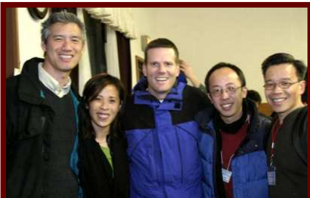
Attending first WCC in 2005

The Lord continued using different people and experiences to break me down in order to begin teaching me more about Himself — an all-powerful, relational God who loved me more intimately than I could ever understand, and sent His only son — in very nature God — to become flesh and humble Himself even to death upon a cross for my sake!