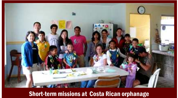
Short-term missions at Costa Rican orphanage

God started working in us immediately after we signed up. First there was a perspective shift. Newsong runs a rigorous 5-month training for short-term missionaries covering personal walks, team dynamics, spiritual warfare, and culture sensitivity. Before attending the training, we thought that a mission trip was about bringing God to the country we would serve in. We realized through the training that God is already there and has been there long before we were called to go! Our role is to humbly partner with Him and be sensitive to what He wants us to do. This truth revealed our pride and motivated us to continue to walk closely with Him to experience Him even more.