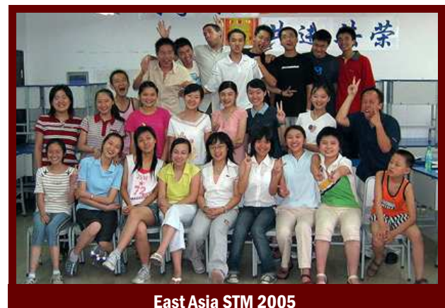
East Asia STM 2005

"After all, only super Christians go on missions, right? I didn't even consider myself worthy to be called a Christian! Yet, God would not let me forget that sister's sharing so I prayed and asked Him to help me relate and understand her brokenness."