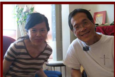
Present and past WCF Treasurer

Vision and purposes ▲ World Christian Fellowship (WCF) is committed to fiduciary standards that are above reproach and continuously strive to develop and improve the organization's financial and financial resource systems.