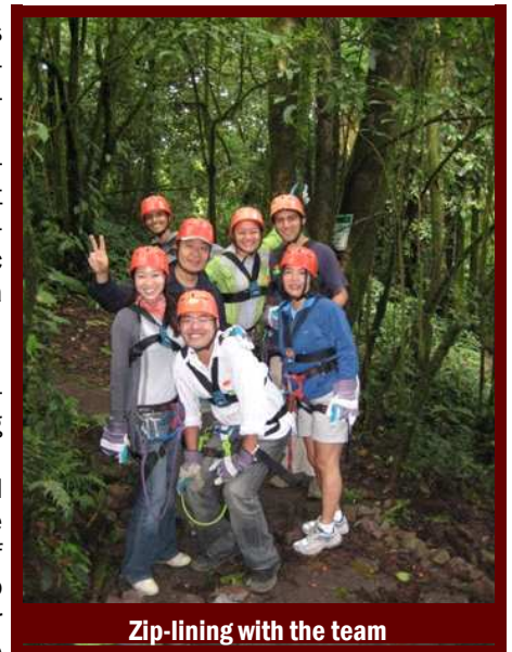
Zip-lining with the team