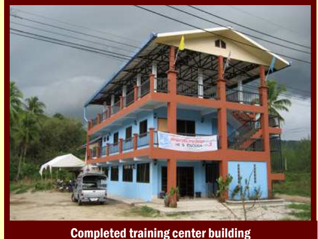
Completed training center building

Ministry in Thailand ∞ The first two short-term trips in 2007, January and July, involved construction work on a training