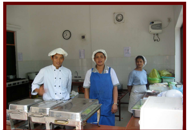
Workers at Hagar's restaurant and catering business

“... by no act of my own, I now have a relationship with God because of His son, Jesus Christ. In a similar way, I need to reach out to the women and children of Cambodia: to serve them in whatever way I can, to let them know that God has not forsaken them, God has not forgotten them, and that they are not alone.”