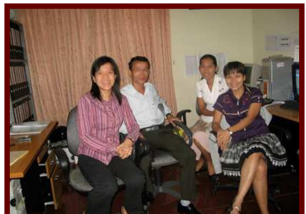
Some Hagar staff

In a country where pre-arranged marriages still frequently ...continued on page 3