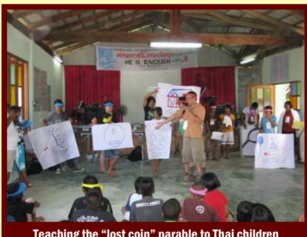
Teaching the "lost coin" parable to Thai children