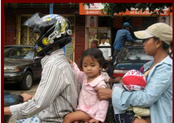
Cambodian family of four on a scooter