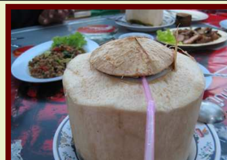
Thai coconut juice and spicy basil pork

Missions is like a pair of chopsticks. One moves while the other is stationary. It takes two to be effective. Missions requires goers ("movers") and senders ("stayers"). Each time you pick up a pair of chopsticks the one that moves may be the one that had stayed still previously. Likewise, when missionaries aren't always moving, they may serve as senders for others, working together on a common goal.