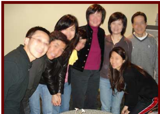
The like-minded and hearted gather to pray