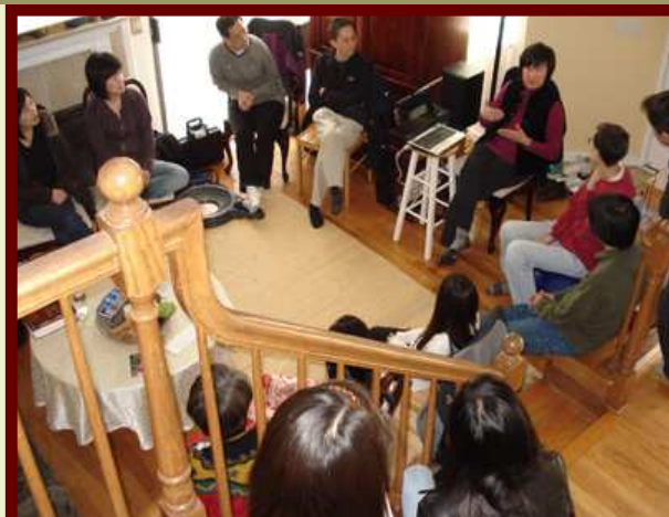
The first mid-peninsula prayer gathering