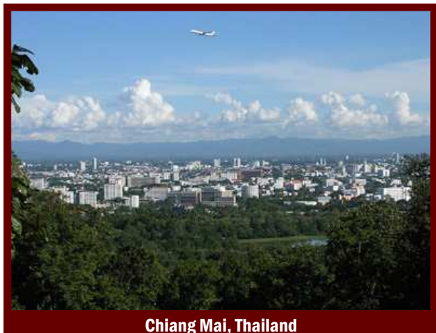
Chiang Mai, Thailand